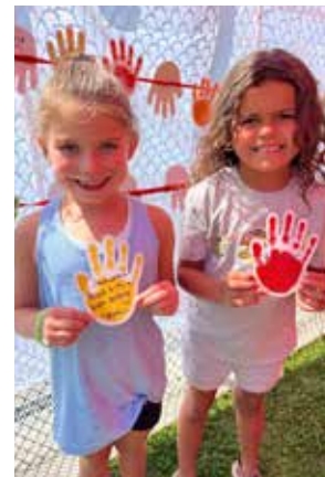
Our Helping Hands Wall and Food Collection table along with the smiles from our campers, brightened Nabby throughout the week!