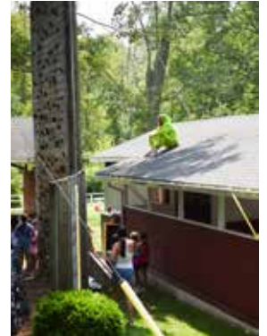
Some Care Bears worth 500 points were hard to find!