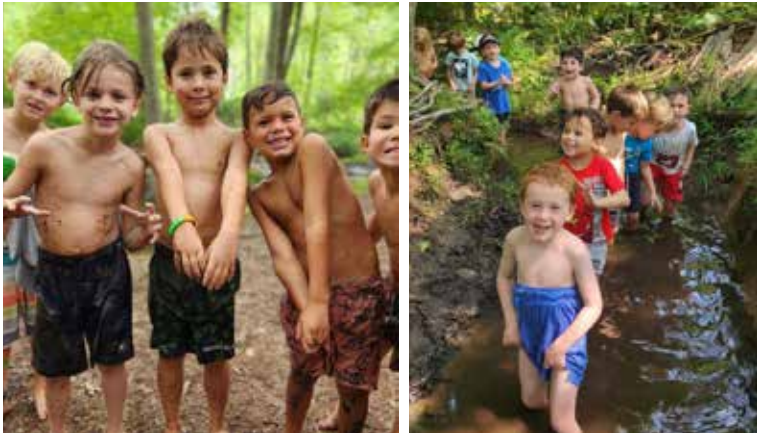
Many of our groups enjoyed time on the Nature Trail, making s'mores, walking in the stream and making clay masks!