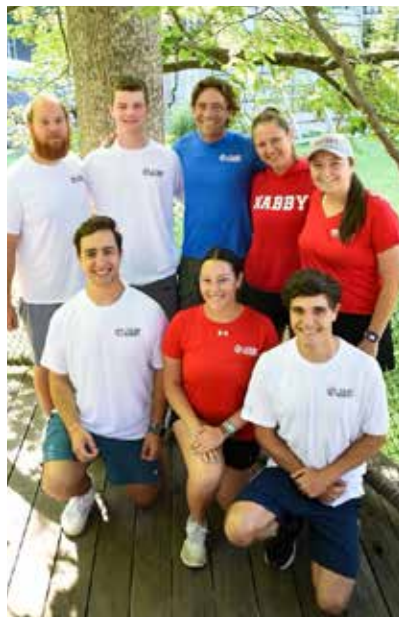
Team Aerial Adventure!