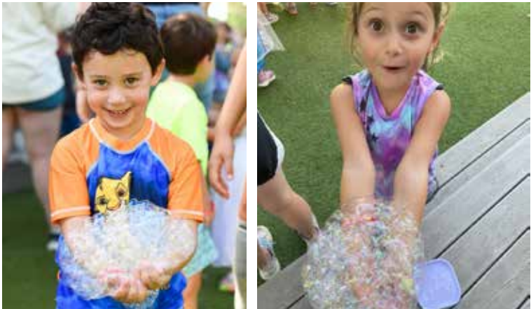
For our youngest campers, "Frozen" Friday on Disney Day featured an "Olaf" Dodgeball game, snowballs and lots of bubbles!