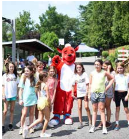
A group selfie with Scooter for 500 points