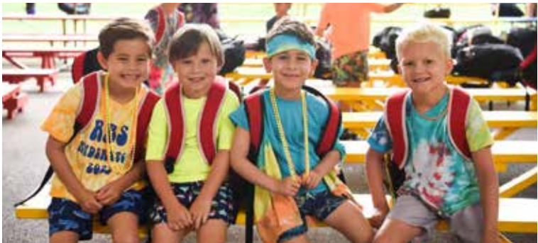
Feelin' Groovy on Tie-Dye/Neon Day!