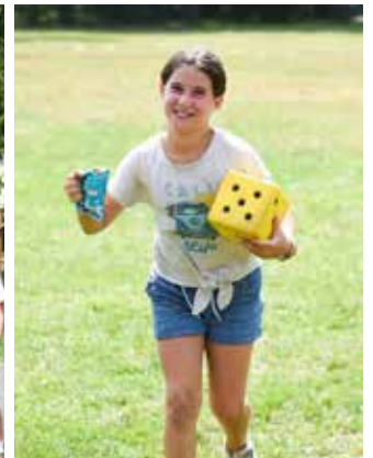
A large yellow dice=400 points! A Scooby Doo snack wrapper was 50 points.