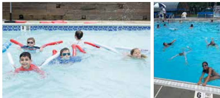
Campers giving it their all in swimming laps for Project Morry