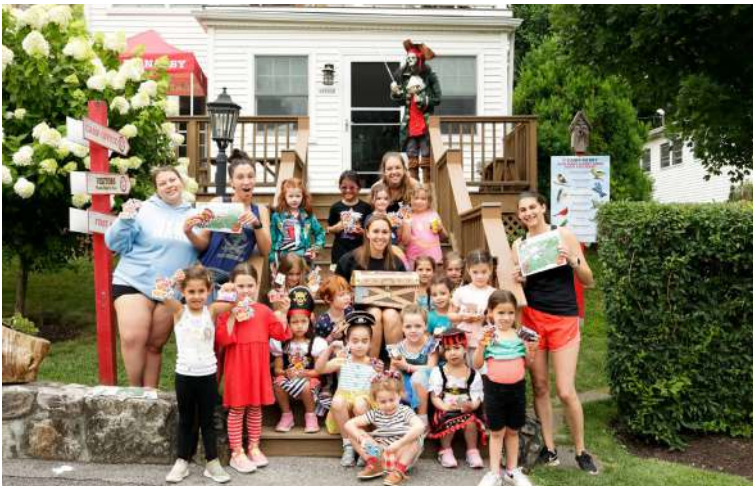
Our Pre-k and kindergarten groups participated in a Treasure Hunt for jewels using special treasure boxes they made in arts & crafts. All our pirates had a blast following their treasure map clues and finding treasure!