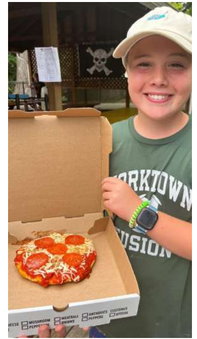
Pizza Friday! Our Cooking Interest Period made homemade dough and personal pizzas cooked on the grill for a delicious way to start their weekend!