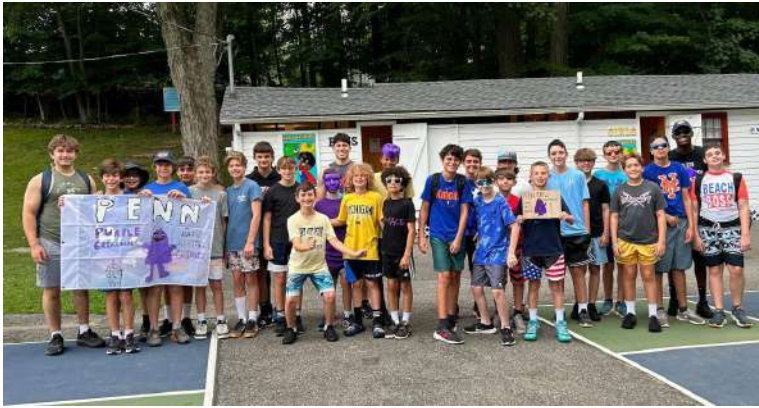
PENN PURPLE GRIMACES