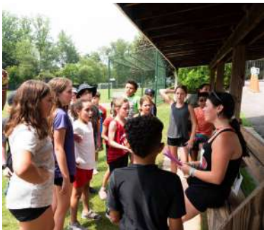
A Frog group earning their food station slip with their song