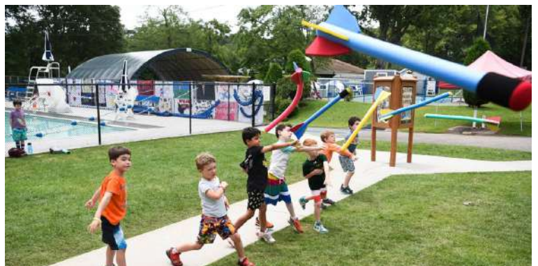
Launching rockets with Princeton and our science interest period!