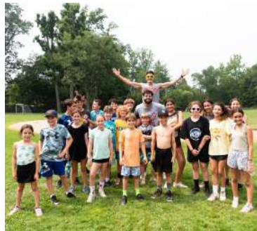
The winners! Insects #2 and #3 celebrate their victory.