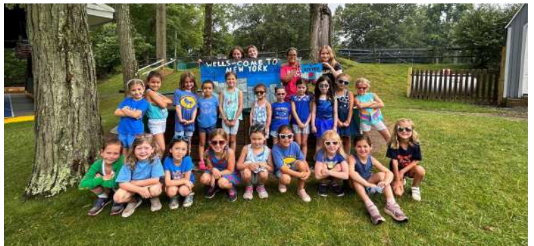
WELLS-COME TO NEW YORK