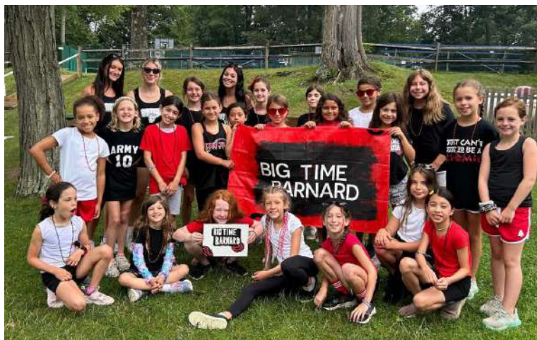
BIG TIME BARNARD