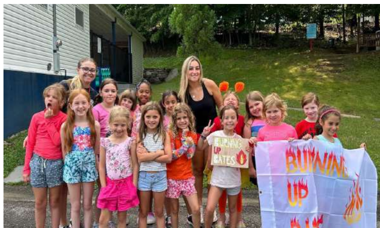
BURNING UP BATES