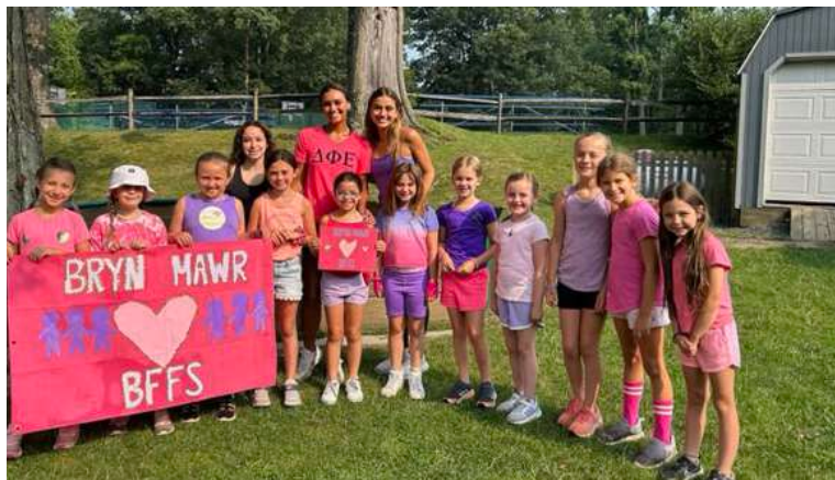
BRYN MAWR BFF'S