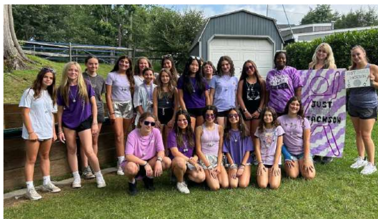
JUST DANCE JACKSON