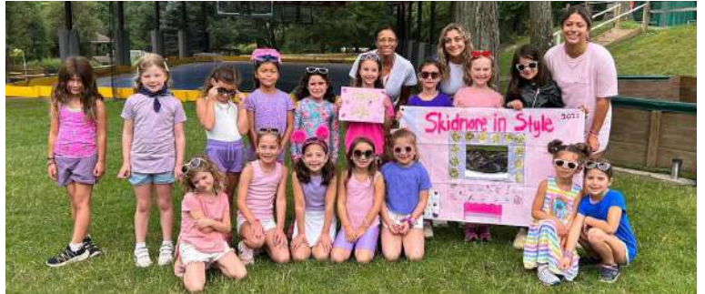
SKIDMORE IN STYLE