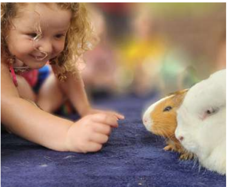
Pups campers meeting fuzzy and hard shelled new friends!