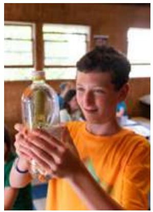
In our new science interest period, campers enjoyed a variety of experiments, made rockets & a solar bag!