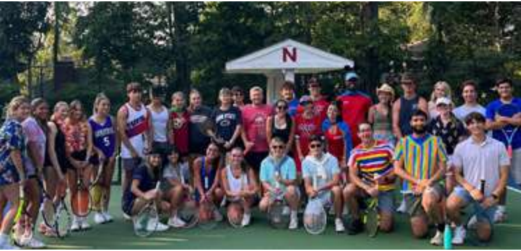
Counselor Tennis Night featured creative costumes including the one and only Bert & Ernie.