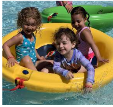
Dur Cubs group enjoyed a special ride at instructional swim!