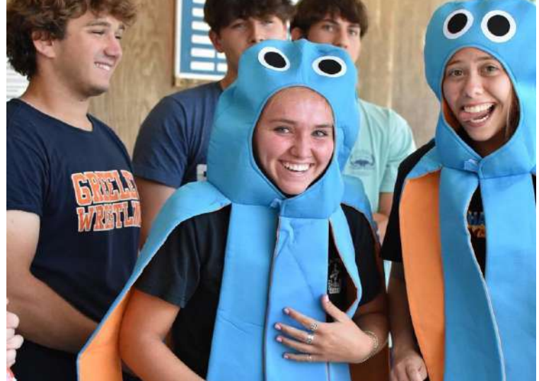
The flying octopuses had us all laughing!