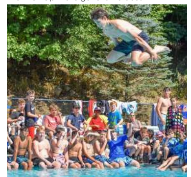
Great style Logani