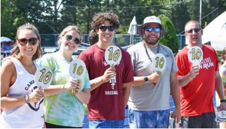
Our esteemed judging panel