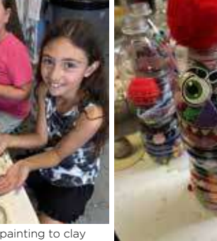
Campers enjoying everything from balloon painting to clay and mixed media collage!