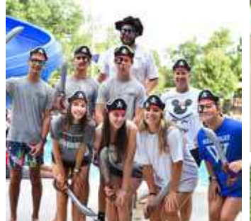
Our Swim staff were the stars of our morning Pirate Show on the big pool stage!