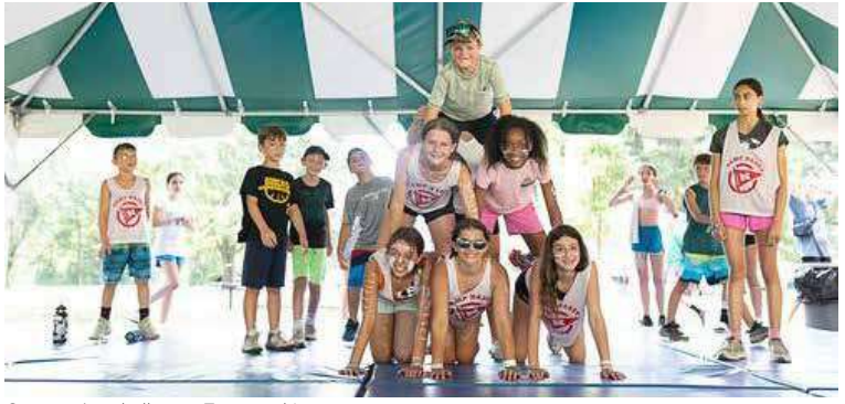
Gymnastics challenge: Teamwork!