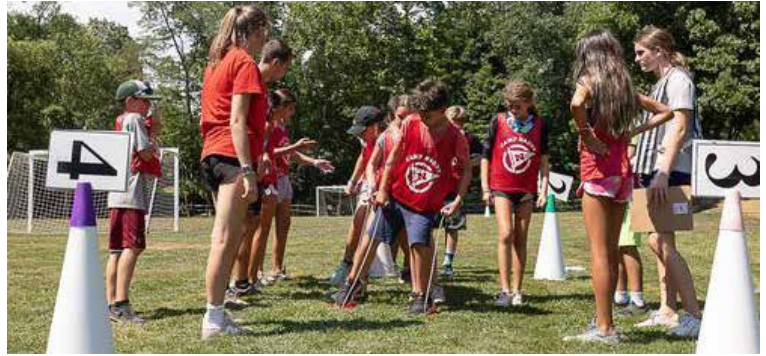
Mastering footwork and unity!