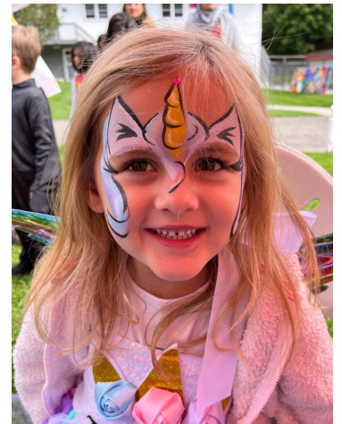
Beautiful face painting by Aimee