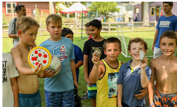
Finding treasures around camp was super fun!