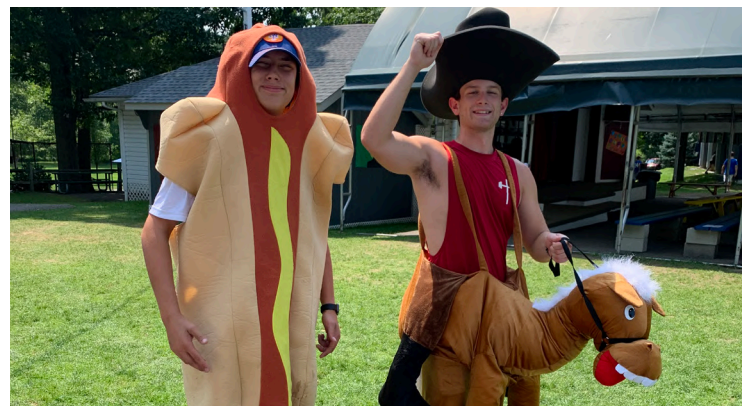
Hot dog Man and Cowboy were two of the big point items in the Scavenger Hunt.