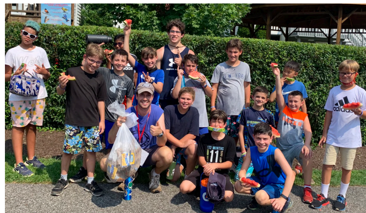
Winning team Tulane with the candy/ice cream wrappers that gave them almost 5,000 points!

Everyone had a super fun time and it looks like the Scavenger Hunt will return in Epic fashion for next year too!