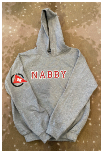
NABBY SWEATSHIRT - $40

If you are interested in ordering any item(s), please send an email to info@campnabby.com with the item name and size. We will get back to you right away to secure payment and confirm shipping or pick up options. Look for more items to come and an online store as we get closer to camp!