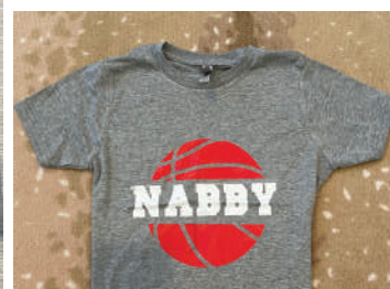
NABBY SOCCER OR BASKETBALL Tee shirt - -$18 Long sleeved tee - $20

FOR ALL PRODUCTS SIZES RANGE FROM YOUTH EXTRA SMALL TO ADULT EXTRA LARGE: