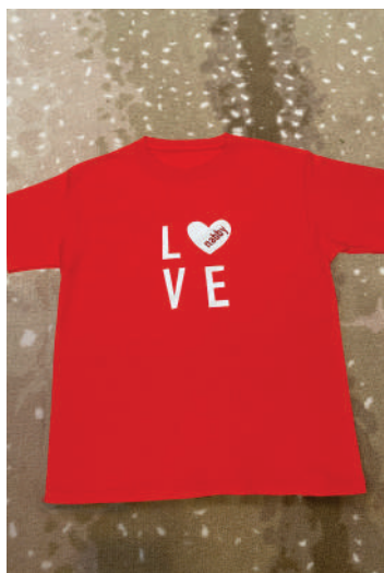
NABBY LOVE SHIRT Tee shirt - -$18 Long sleeved tee - $20