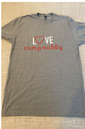
LOVE CAMP NABBY SHIRT Tee shirt - -$18 Long sleeved tee - $20