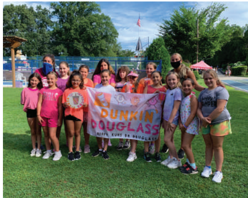
The Dunkin' Douglass Donuts were delicious!