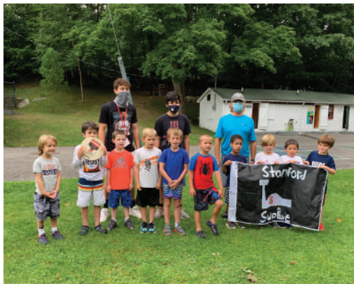
The Stanford Swole muscled their way to stardom!