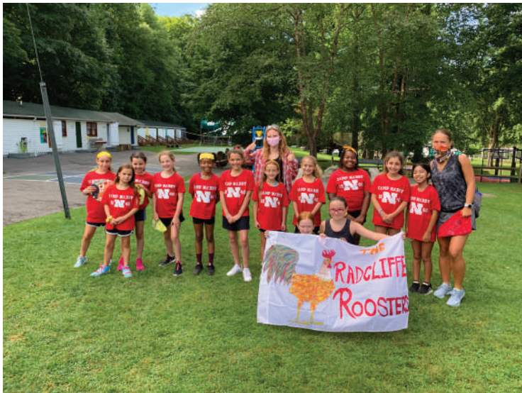
The Radcliffe Roosters had a lot to crow about!