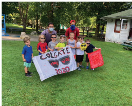
The Colgate Cool Kids were oh so groovy!