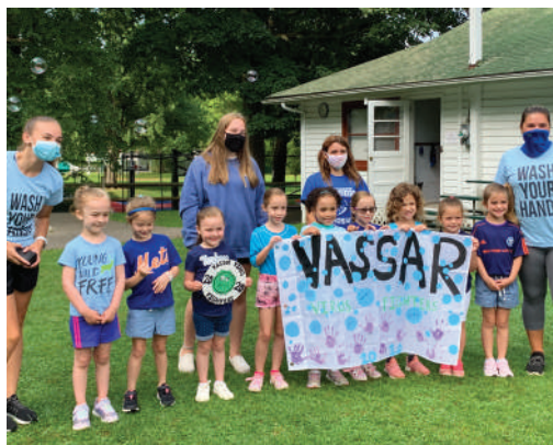
The Vassar Virus Fighters showed bubbly energy on stage!