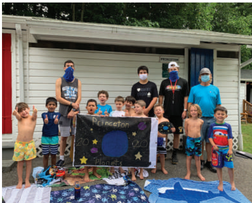
The Princeton Planets were out of this world!