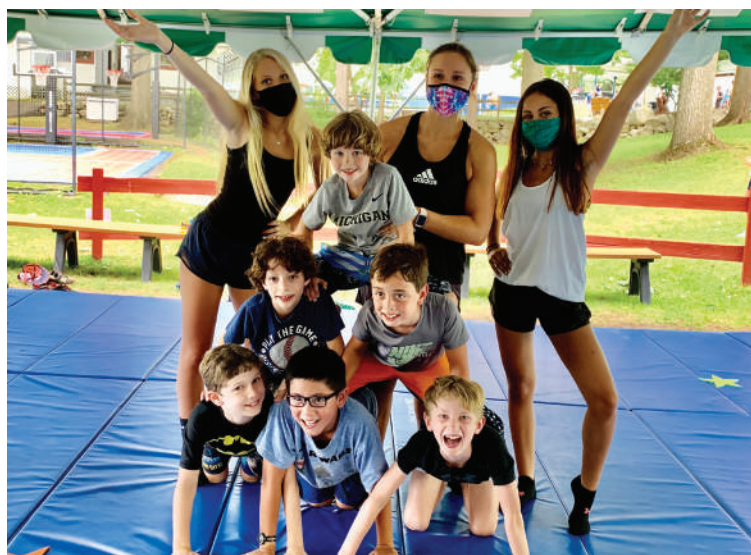
Columbia boys build a pyramid!

No matter their age, all of our Nabby campers enjoy the many activities at gymnastics and can dream of becoming an Olympian one day!