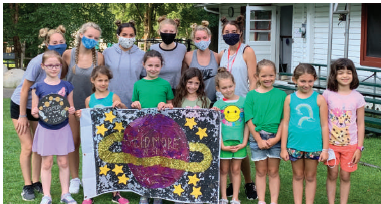
Skidmore in Space rocked the place!