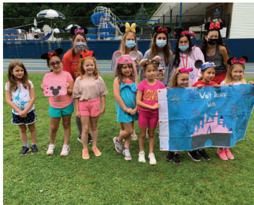
Walt Disney Wells was a fairy tale that came to life on stage!