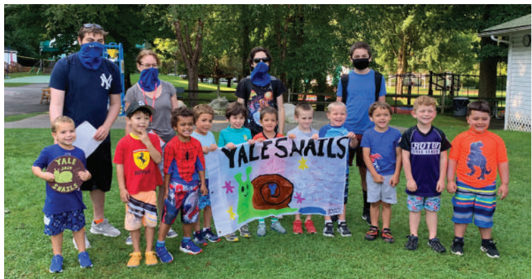
The Yale Snails came out of their shells on stage!