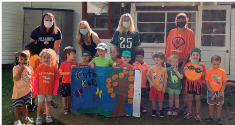
The Cutie Cubs were cuddly!