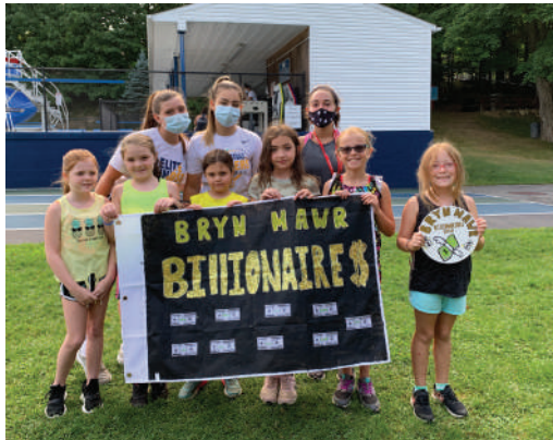
The Bryn Mawr Billionaires were money in the bank!