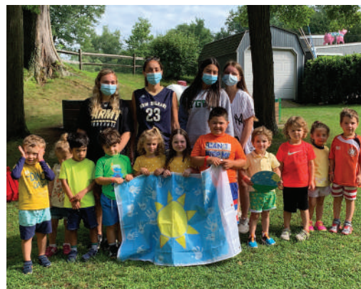
Smith campers brought the sunshine out today!