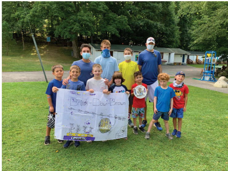
Brown Break Down really wowed us with their awesome moves!