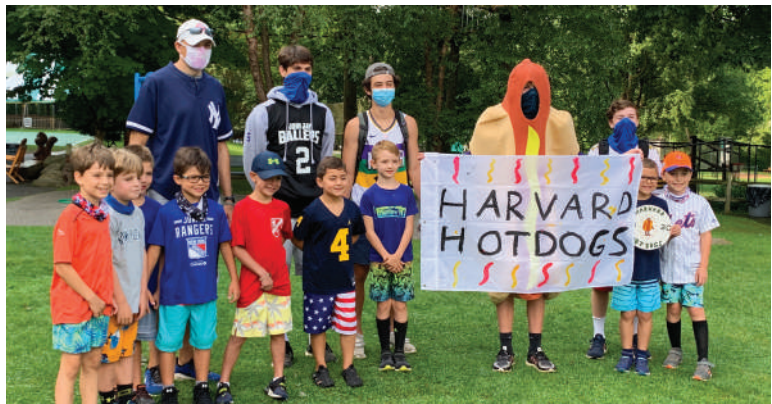
The Harvard Hotdogs really cooked on the stage with their dance moves!