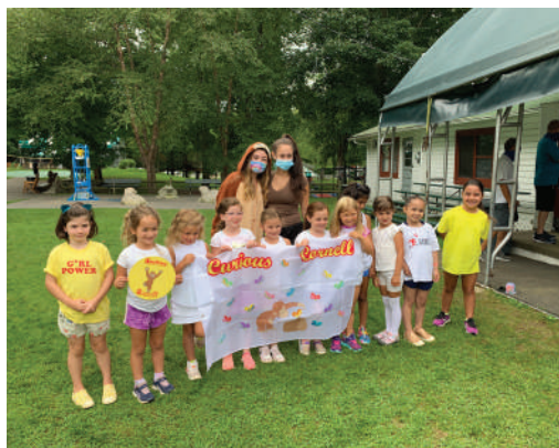
Curious Cornell didn't monkey around on stage!