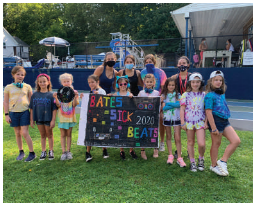
The Bates Sick Beats were music to our ears!