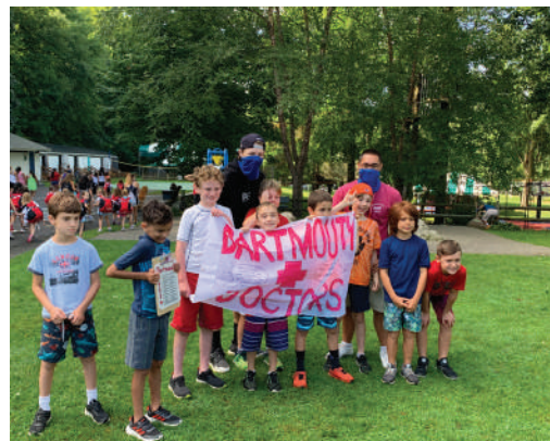
The Dartmouth Doctors made a house call to the Nabby stage!