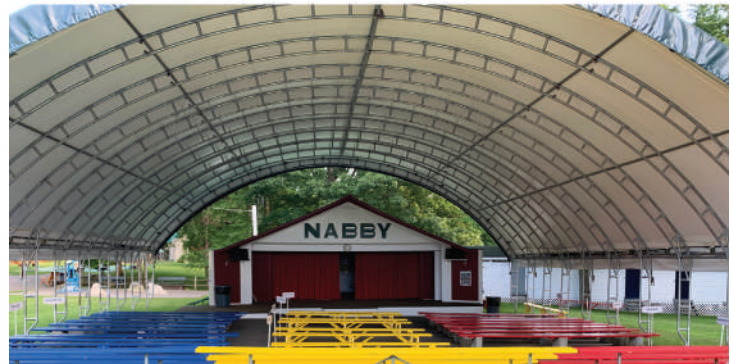
The Nabby stage...then and now.