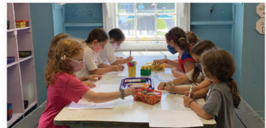
The original Art Shack still remains! A little brighter and more colorful, but still a favorite Nabby activity!