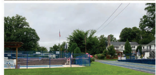
The view from the stage looking up to the "casino". The entire camp from the 40's could fit in the area that our two smaller pools now occupy.