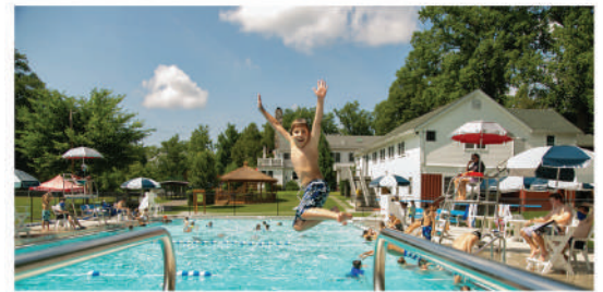
The original pool (with walls manufactured from steel battleships) was replaced by our new, state of the art pool in 2017.