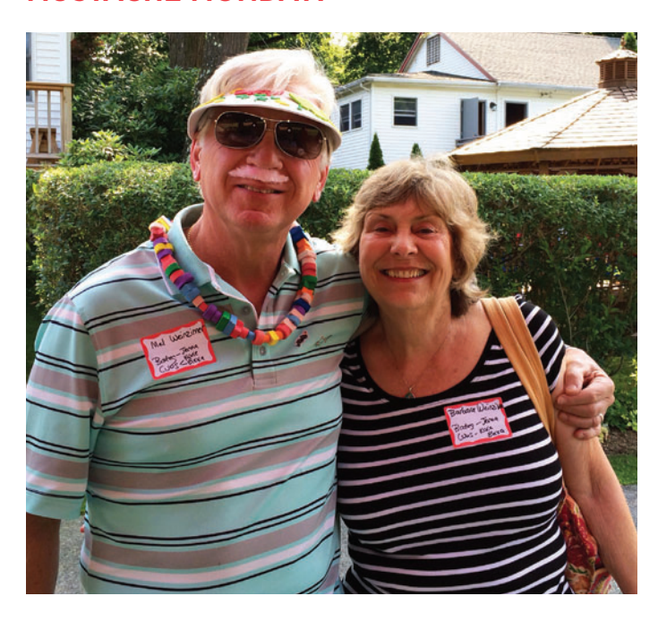
Even family members visiting campers last week got into the spirit of Mustache Monday!