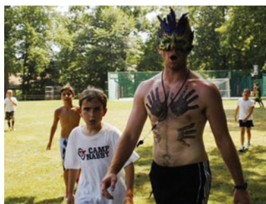
Predator and Prey!!!