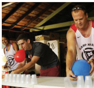
Color War counselor competition!