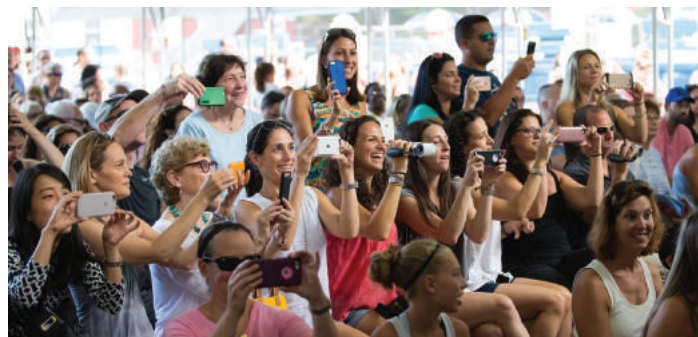
The Jr. Camp Musical Paparazzi!!!