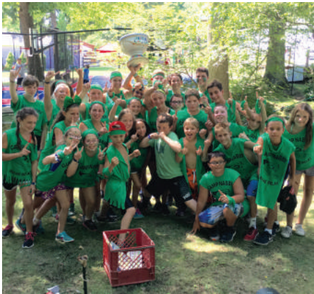
Green team celebrates their hard fought victory!