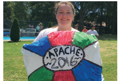
The Arts and Crafts department make sure the batons for the Apache Relay are wrapped, signed, sealed and delivered!