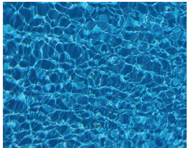
So, if your campers don't want to shower at night... you're welcome!!!

Beautiful beach water of the Bahamas? St. Tropez? Amalfi Coast? Better than that - it's the water in our crystal clear Nabby pools!!!