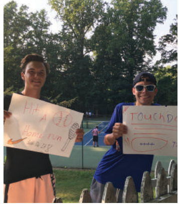
Some mixed doubles pairs dressed alike!