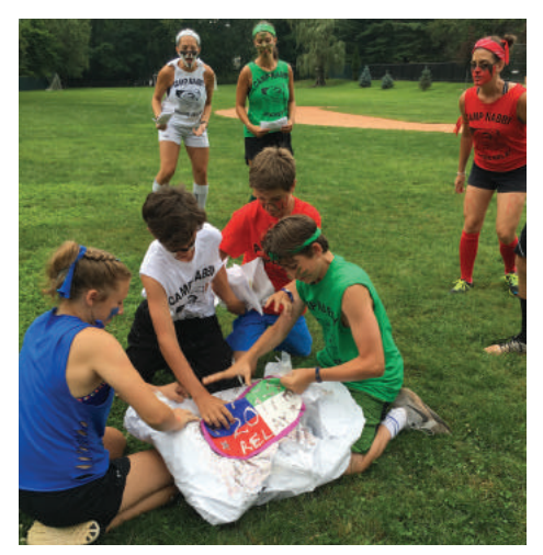
All four runners unwrapping and searching for their batons!