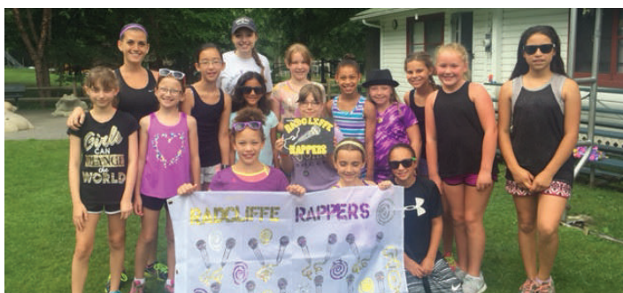
BEST CHEER - RADCLIFFE!