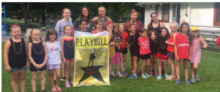
BEST OVERALL - BRYN MAWR!