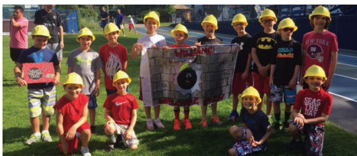
BEST BANNER - WILLIAMS!