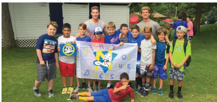
BEST PLAQUE: (TIE) DUKE!