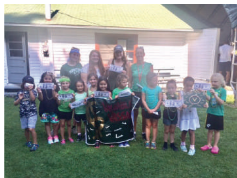
The Valuable Vassars were very vivacious!