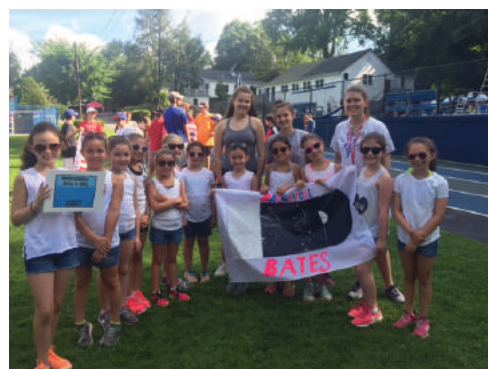
Backstreet Bates bowled us over!