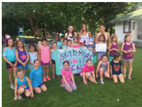
The Skidmore Scales sounded sensational!