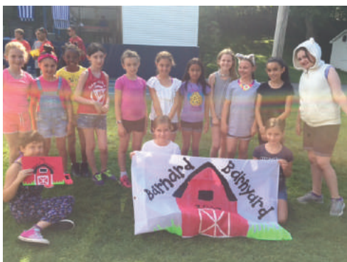
The Barnard Barnyard bellowed boisterously!