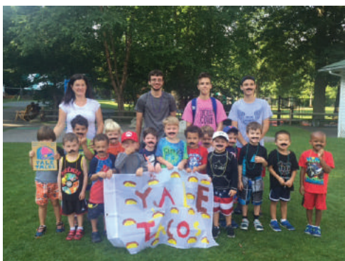
The Yale Tacos were "muy bueno"!