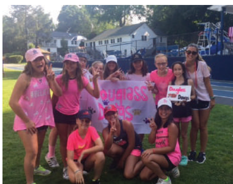
The Douglass Dawgs were delightful!