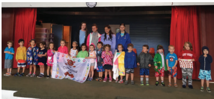
The Cub-a-licious Cubs captivated the crowd!