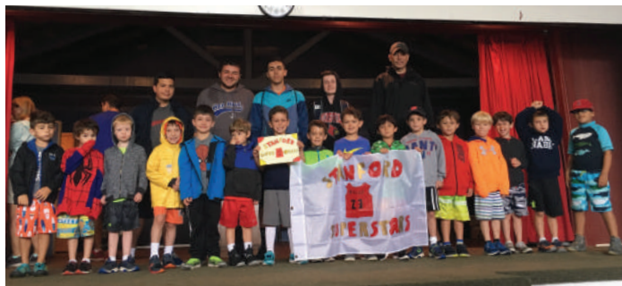
The Stanford Superstars soared spectacularly!