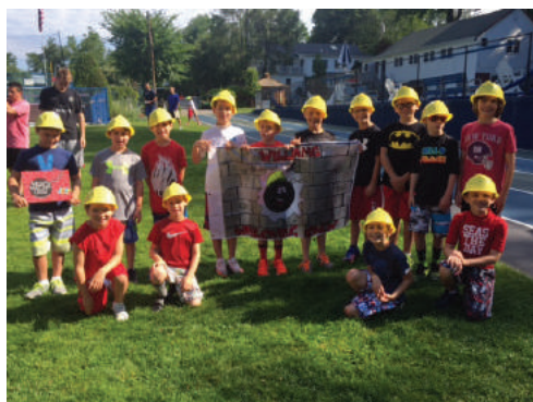
The Williams Wrecking Crew was wonderful!