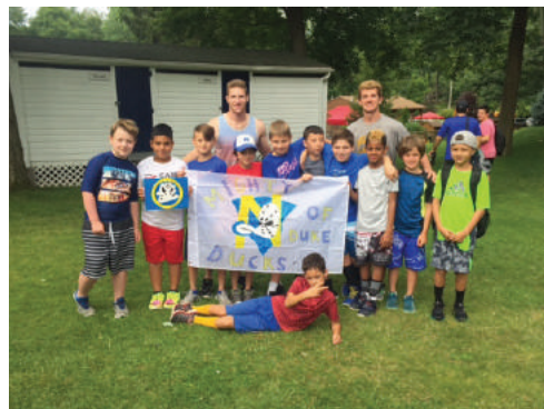
The Mighty Ducks of Duke did it dubiously!