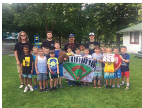
The Brown Bombers were "da bomb"!