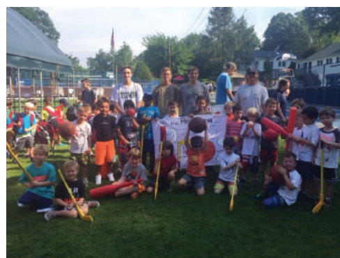
The Princeton Pros were perfect!