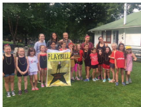
Bryn Mawr on Broadway blossomed brightly!