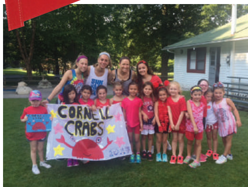
The Cornell Crabs were cute crustaceans!