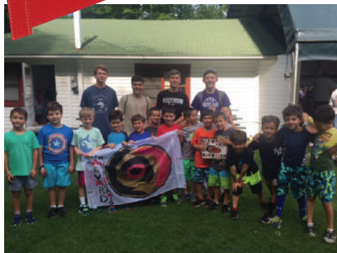
Hurray for the Harvard Hurricanes!