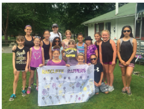
The Radcliffe Rappers really rocked it!