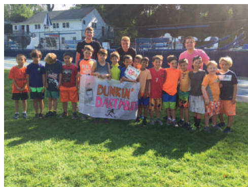
Dunkin' Dartmouth was delicious!