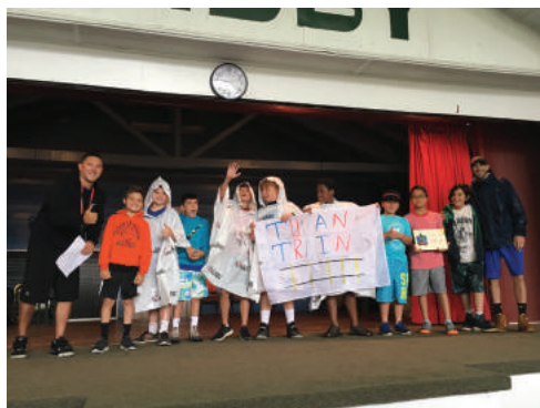
The Tulane Trains were terrific!