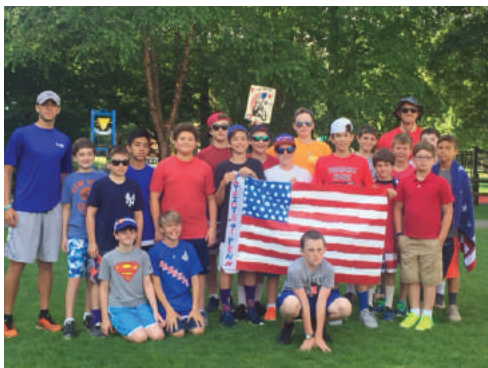
The Patriots of Penn were poised for perfection!