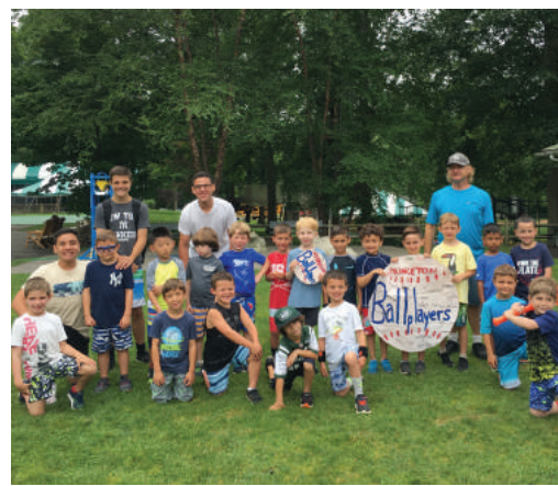
MOST ENTHUSIASTIC - PRINCETON