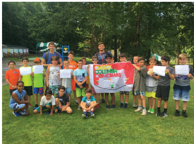
BEST PLAQUE - COLUMBIA