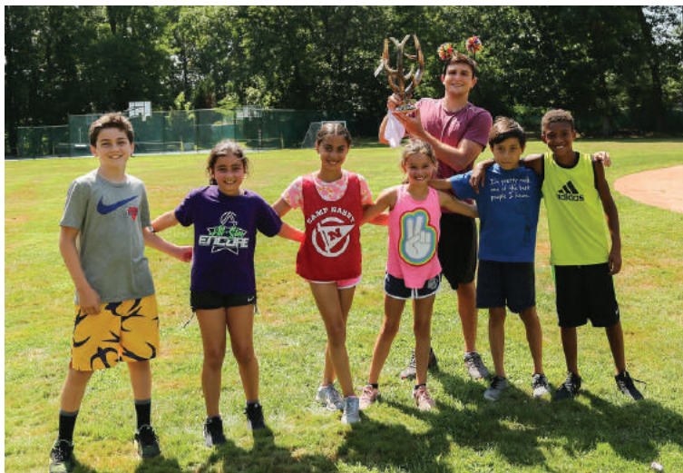
The winning team of Red insects!