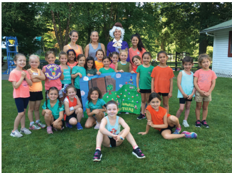
MOST CREATIVE - CORNELL