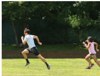
The "Hawk" at full speed.