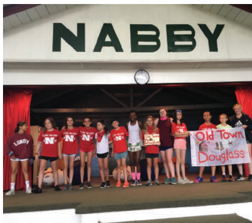
BEST CHEER - DOUGLASS