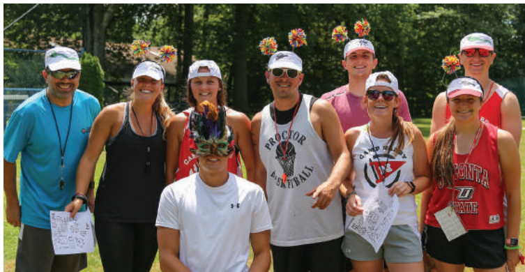
The hawk with team leaders of the snakes, frogs and insects.