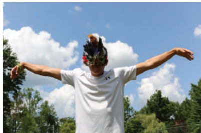
The hawk getting ready to swoop down on it's prey