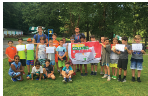
CHEESY COLUMBIA COMEDIANS