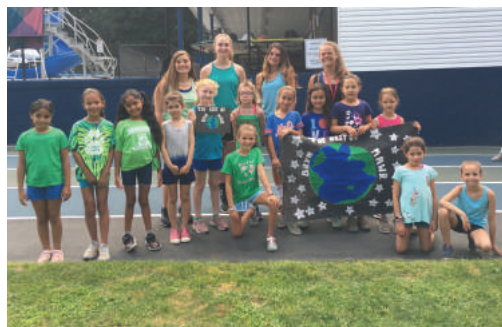
THE BEST OF BRYN MAWR