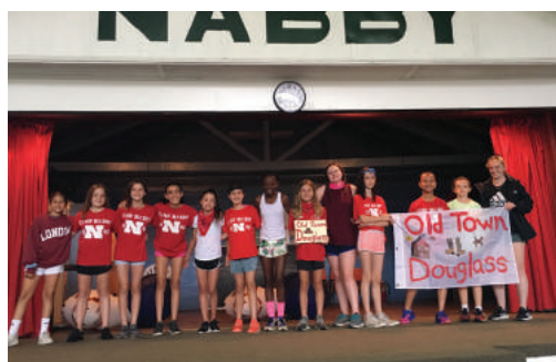
OLD TOWN DOUGLASS