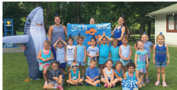
THE SMITH SHARKS