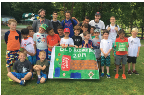
OLD BROWN ROAD