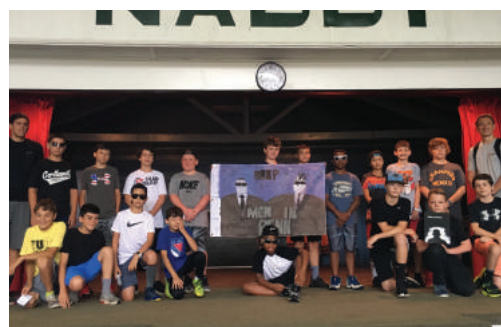
THE MEN IN PENN