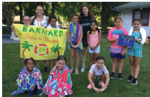
BARNARD BEACH BABES