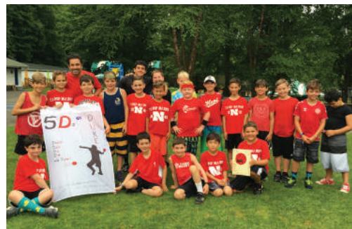
THE FIVE D'S OF DUKE