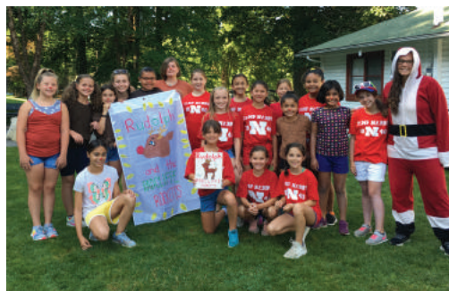
RUDOLPH AND THE RADCLIFFE ROCKETTES