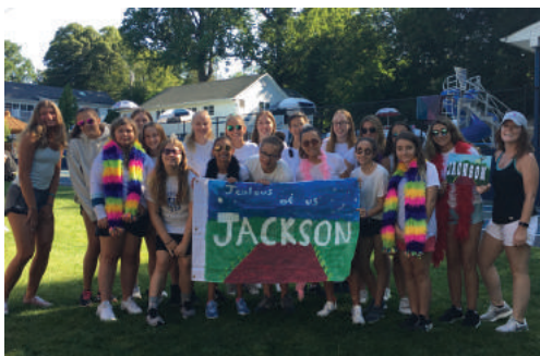
JEALOUS OF US JACKSON