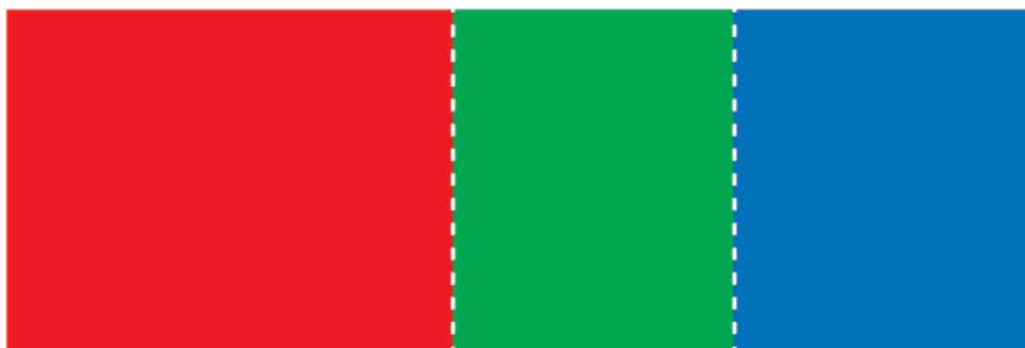
BIG POOL 3'-4' (non-swimmers cannot go in water over chest height)

They are permitted anywhere in the middle pool.