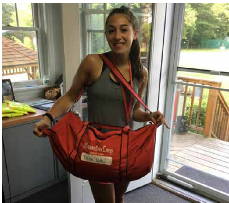
NABBY NEWS | Volume 49 • No 1