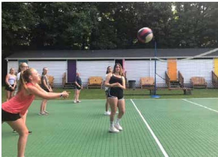
The Jackson girls breaking in our new volleyball court surface!