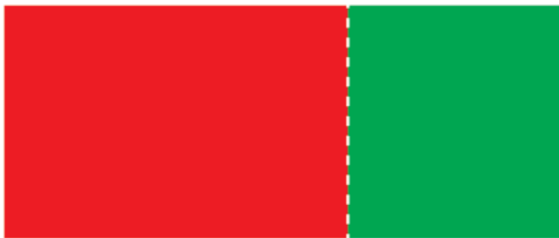
MIDDLE POOL SHALLOW END 3'-4'

Campers cannot be in water above chest height.