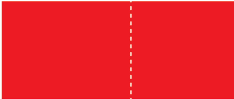
LITTLE POOL 2' DEEP