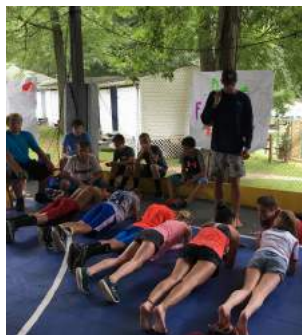
Duke's Fitness Booth