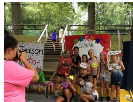
Jackson's Photo Booth