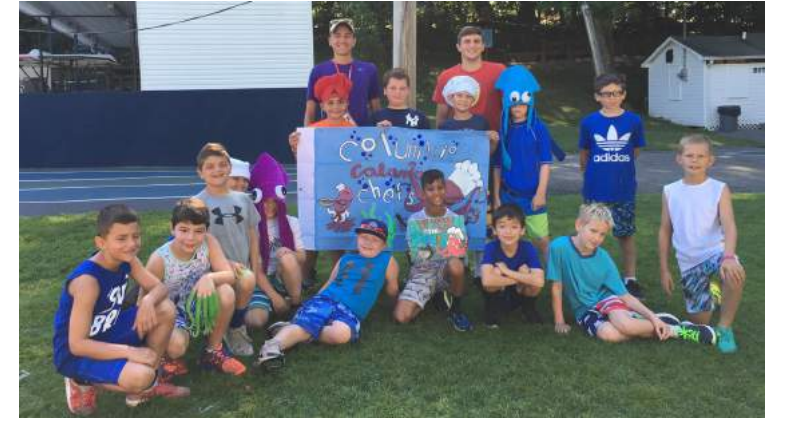
THE COLUMBIA CALAMARI CHEFS