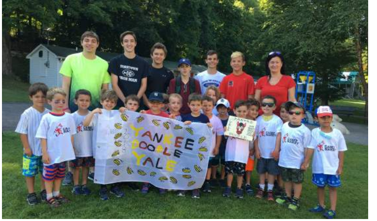
YANKEE DOODLE YALE