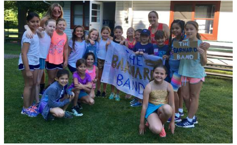
THE BARNARD BAND