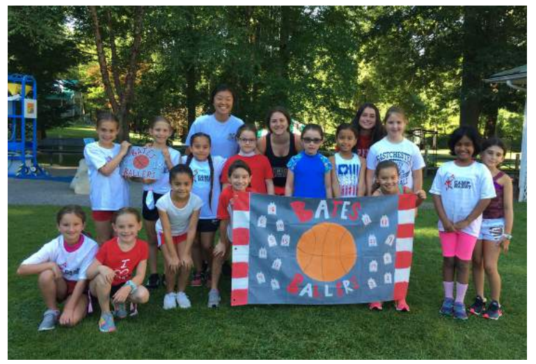
THE BATES BALLERS