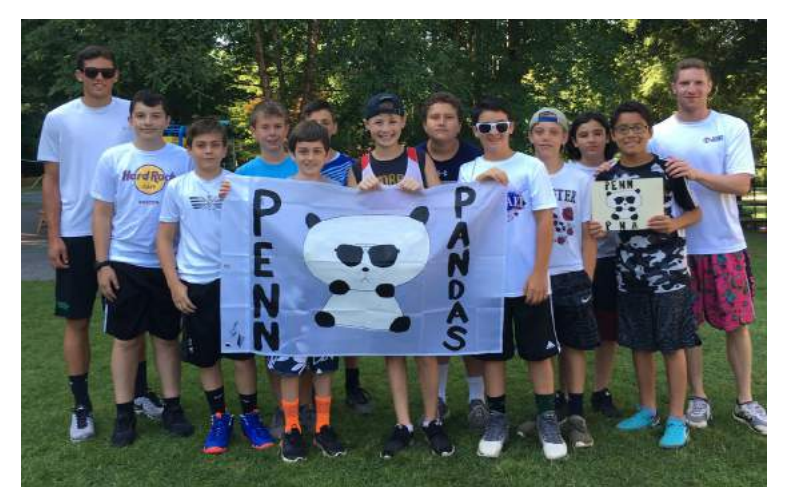
THE PENN PANDAS