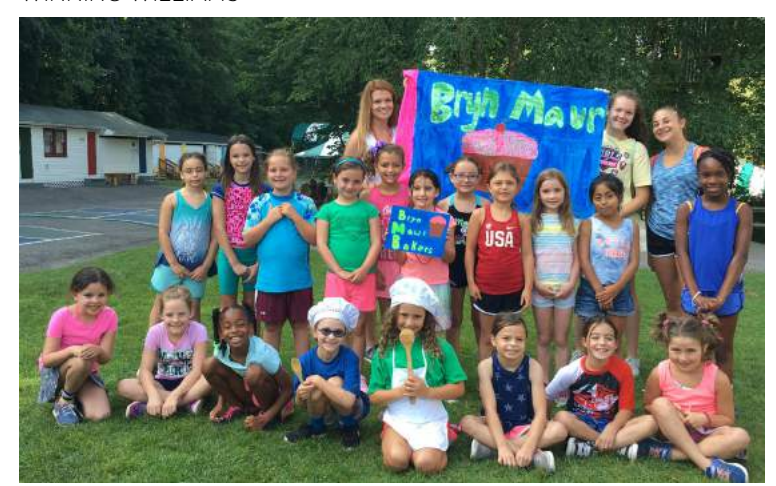
THE BRYN MAWR BAKERS