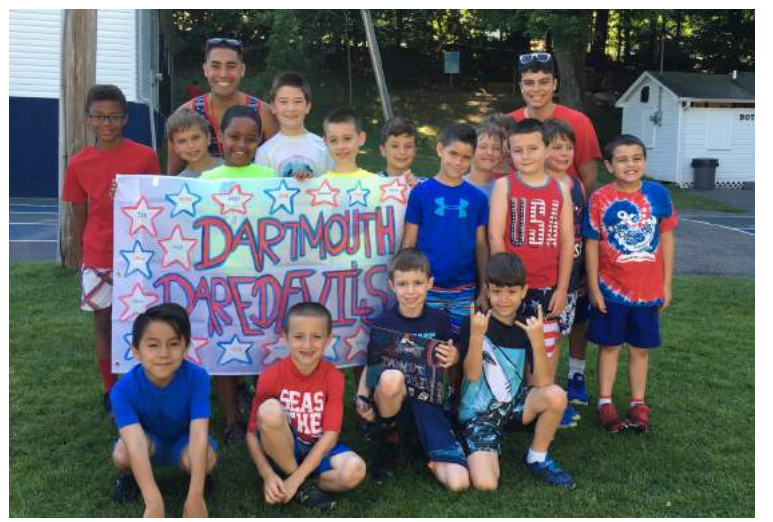
THE DARTMOUTH DAREDEVILS