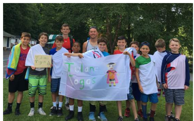
THE TULANE TOGAS