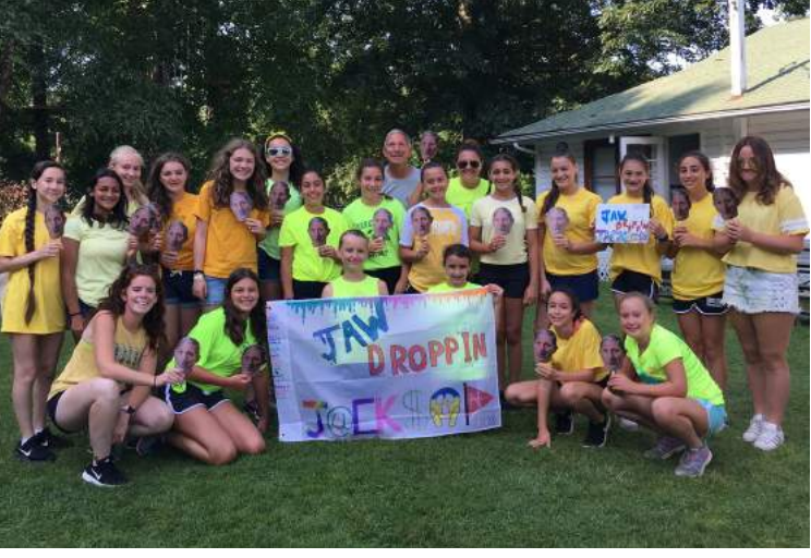
JAW DROPPING JACKSON