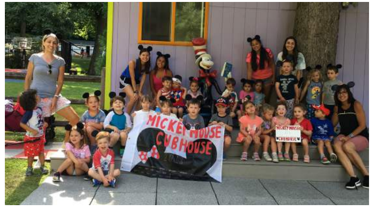
CUBS MICKEY MOUSE CUBHOUSE