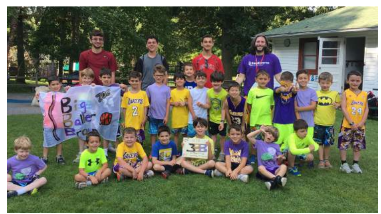
BIG BALLER BROWN