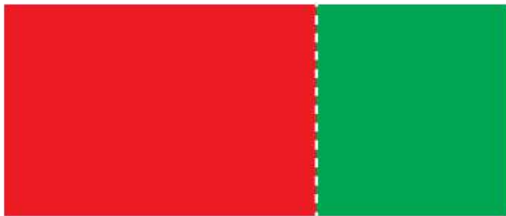
MIDDLE POOL SHALLOW END 3'-4'

Campers cannot be in water above chest height.