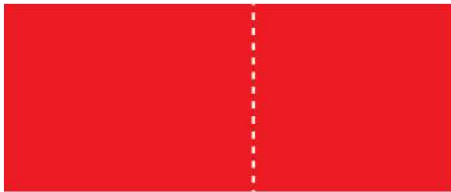
LITTLE POOL 2' DEEP