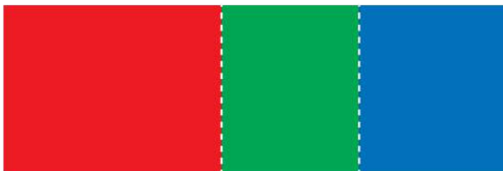
BIG POOL 3'-4'

Have pass middle pool deep-water test. They are permitted anywhere in the middle pool.